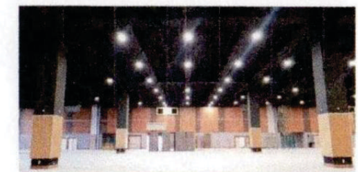
Kinabatangan I, II & III